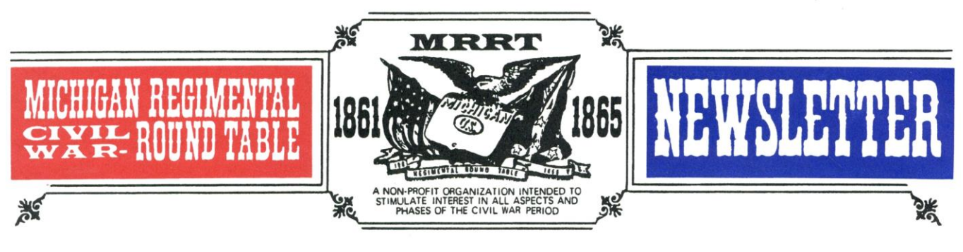
Vol LXI, #4

Michigan Regimental Round Table Newsletter-Page 4